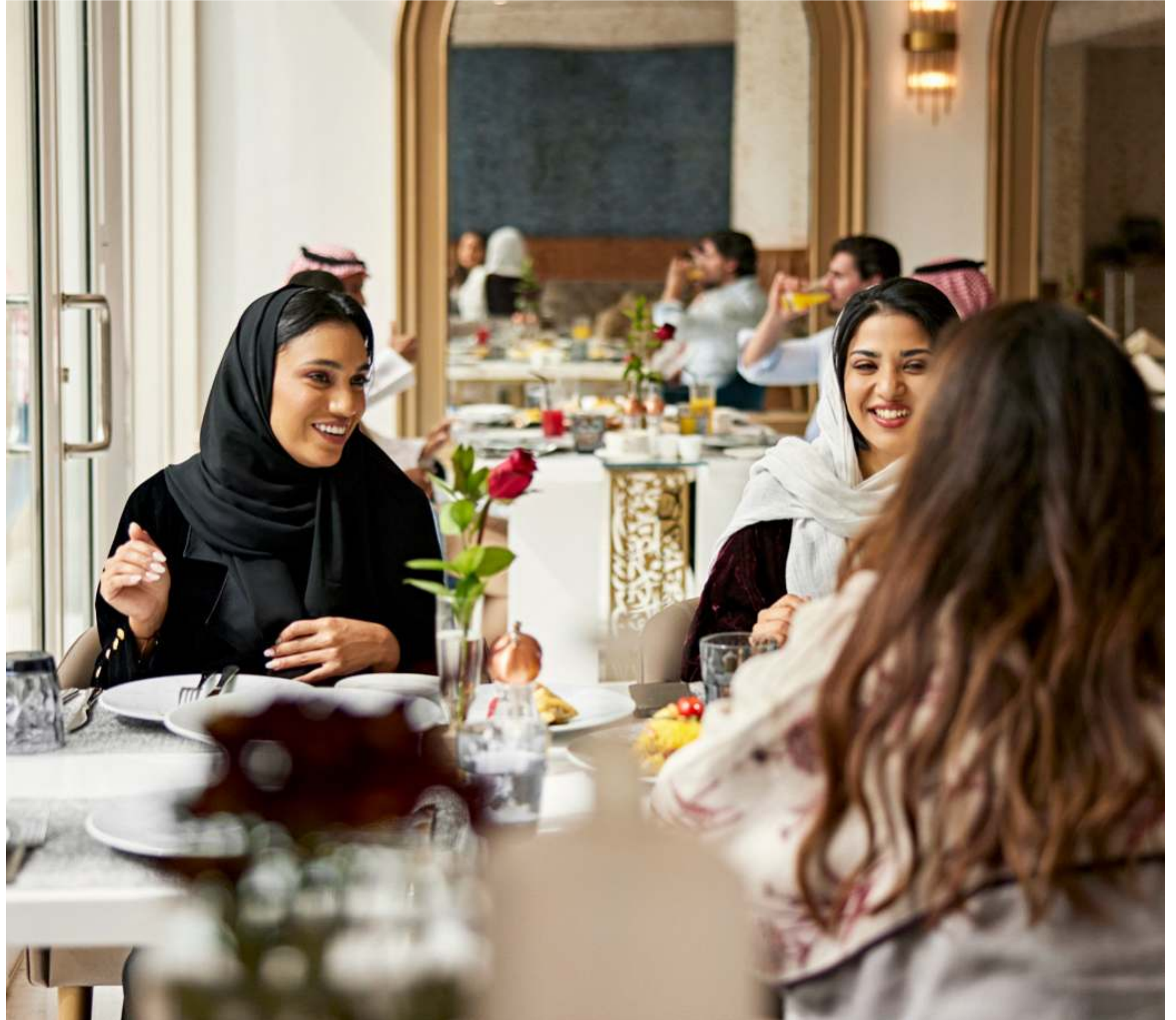
Retail & Dining